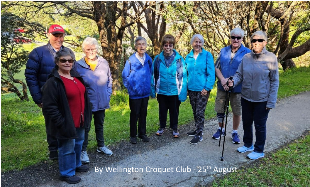
By Wellington Croquet Club - 25 th August