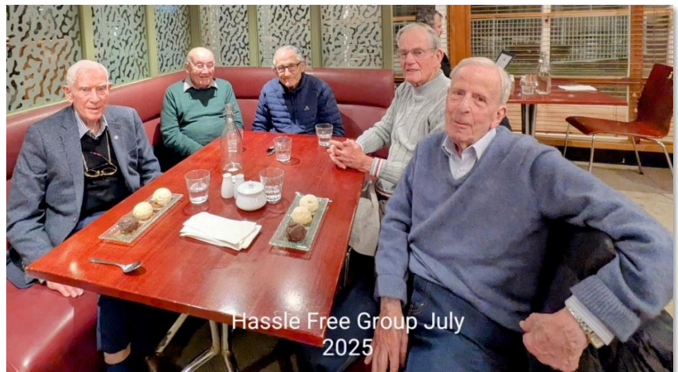
Hassle Free Group July 2025

Our Hassle Free Cooking is amongst the oldest Special Interest groups in our club, active for over fifteen years, with several original members, some of whom now quite properly choose to enjoy the cooking of restaurant chefs as an alternative to cooking in their own kitchen. The group spent a pleasant hour in the host's home before dining at the Brentwood Hotel in Kilbirnie. Not an extensive menu, but the meals were excellent, with a good wine list, and we can recommend it to you as worth a visit.